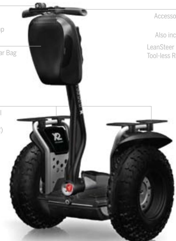
Also included: LeanSteer Frame Tool-less Release